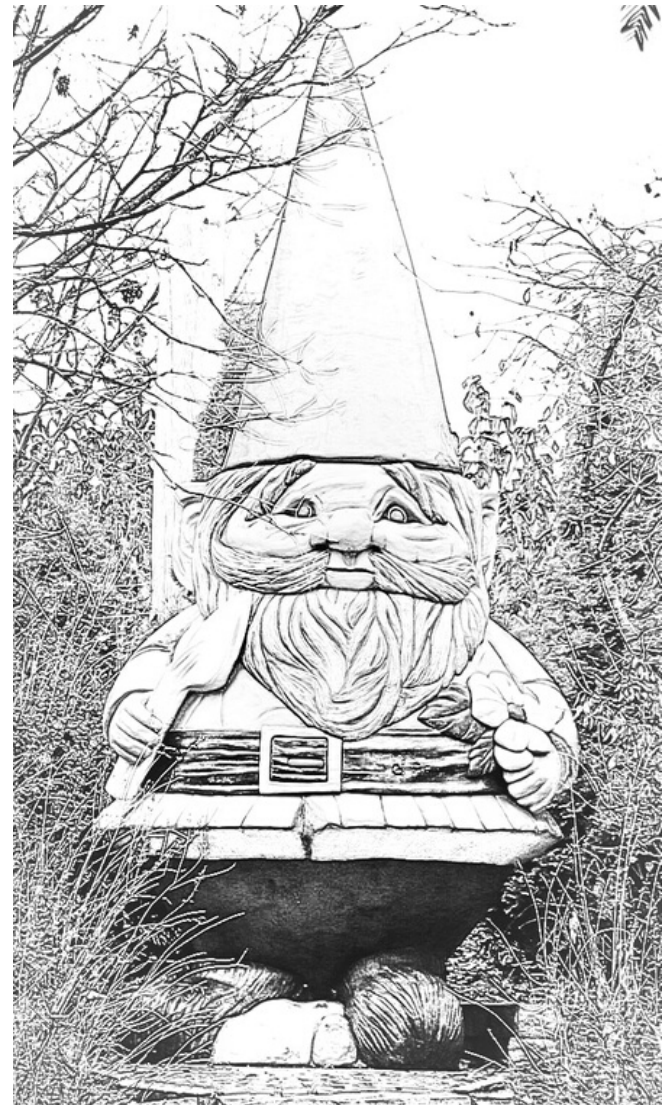
Color in Elwood the 'World's Largest Gnome'

Can you find these 'Iowa' words in the word search?